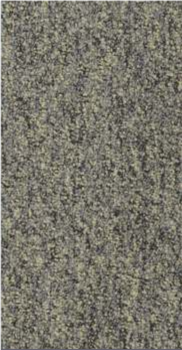
BM 03 FOG