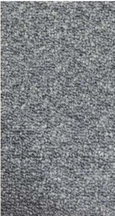
BM 05 SMOKE