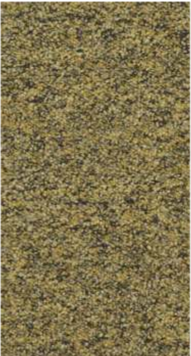
BM 07 TIGER EYE