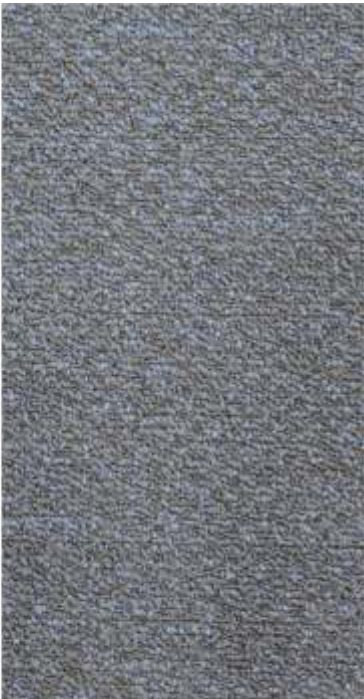
BM 13 ROYAL

it always seems impossible until it's done