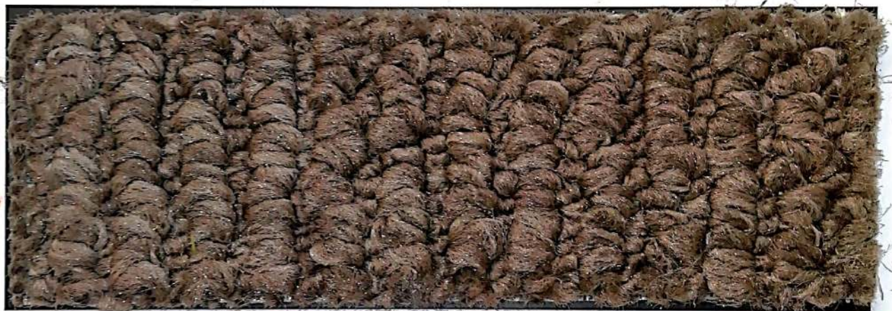
▲ MB 10 MINK