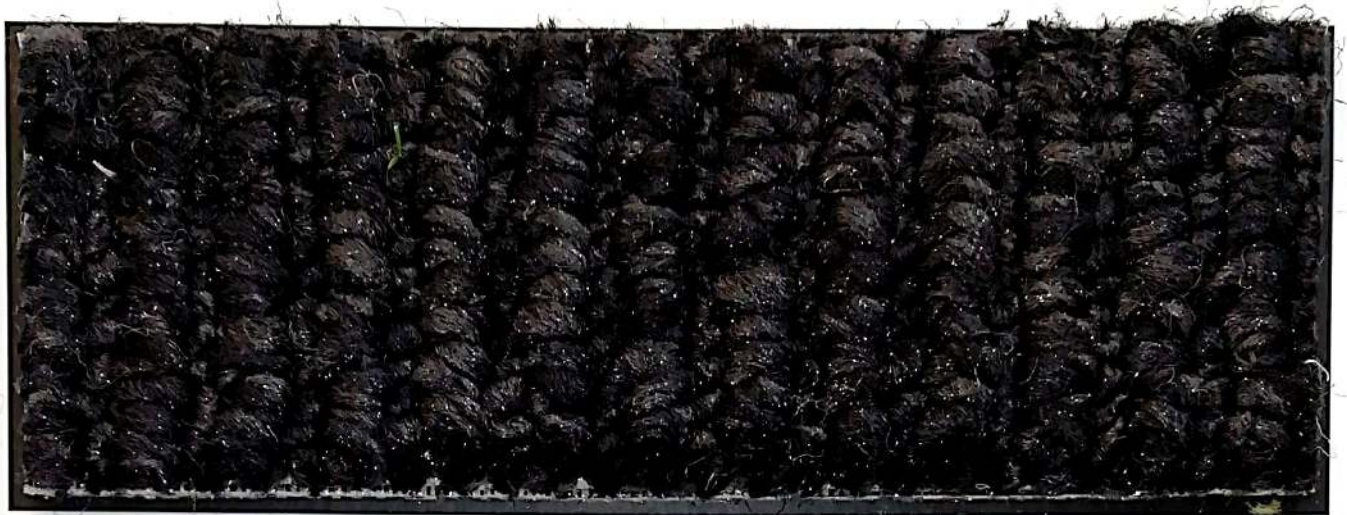
▲ MB 02 SHADOW