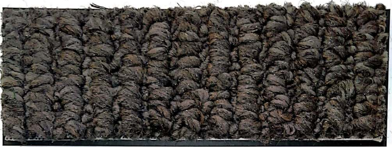
▲ MB 09 ASH