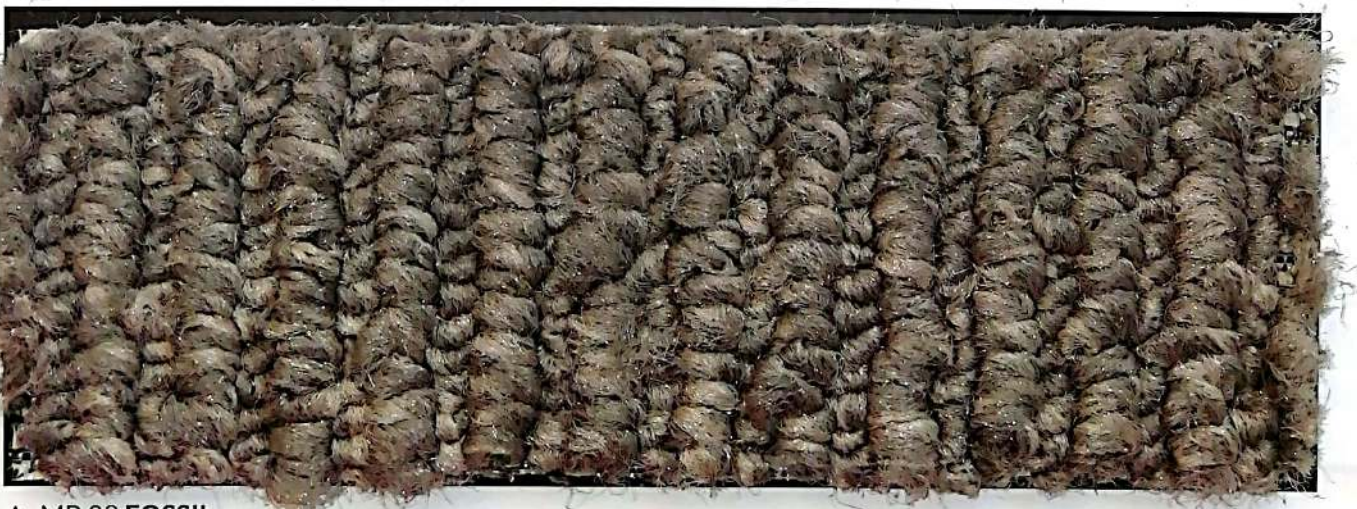
▲ MB 08 FOSSIL