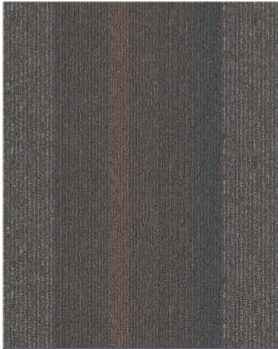
MN 06 COFFEE