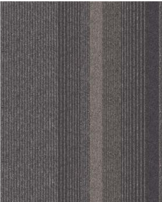
MN 05 BROWN