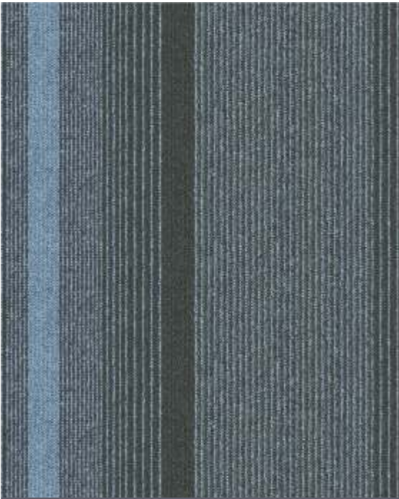
MN 07 BLUE