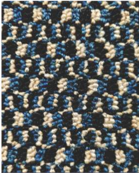
VI 3020 BLUE