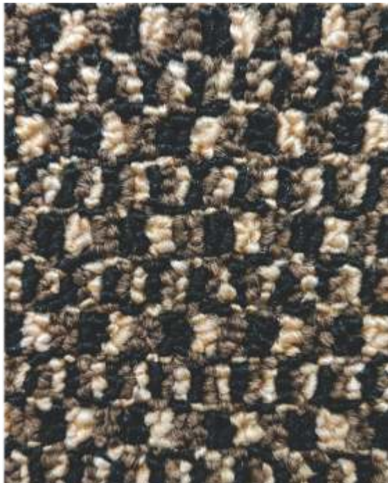
VI 3070 BROWN