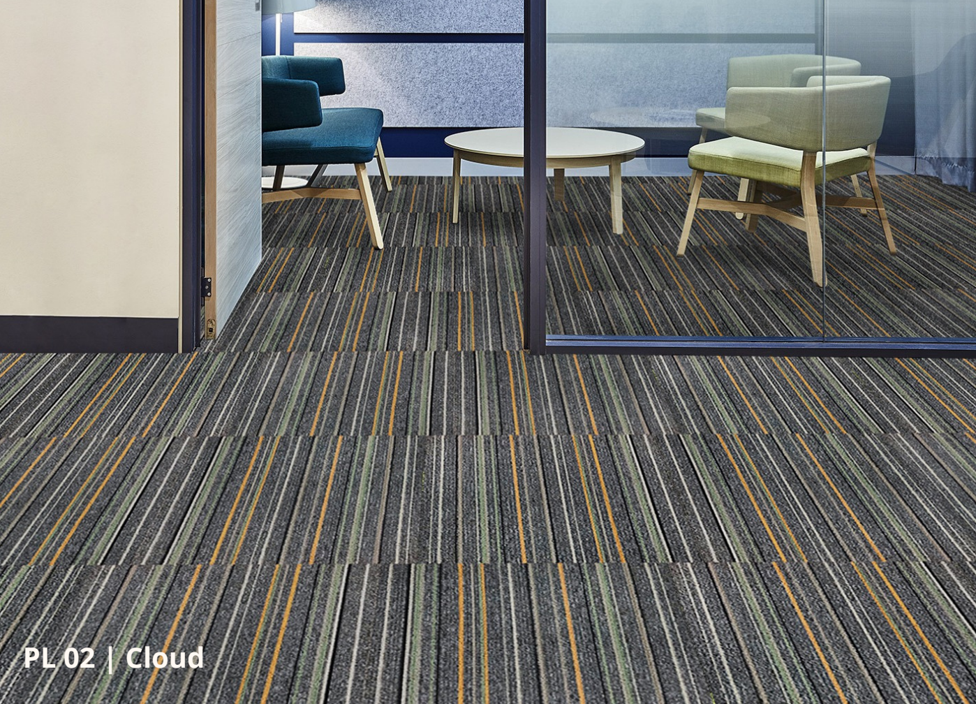
PL 02 | Cloud