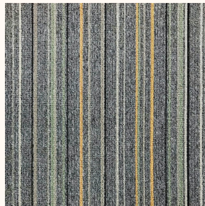
PL 02 | Cloud