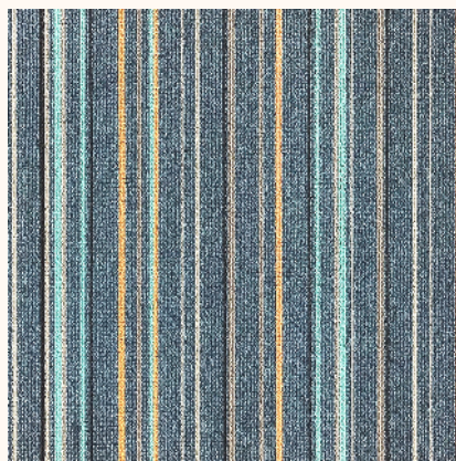
PL 03 | Ocean