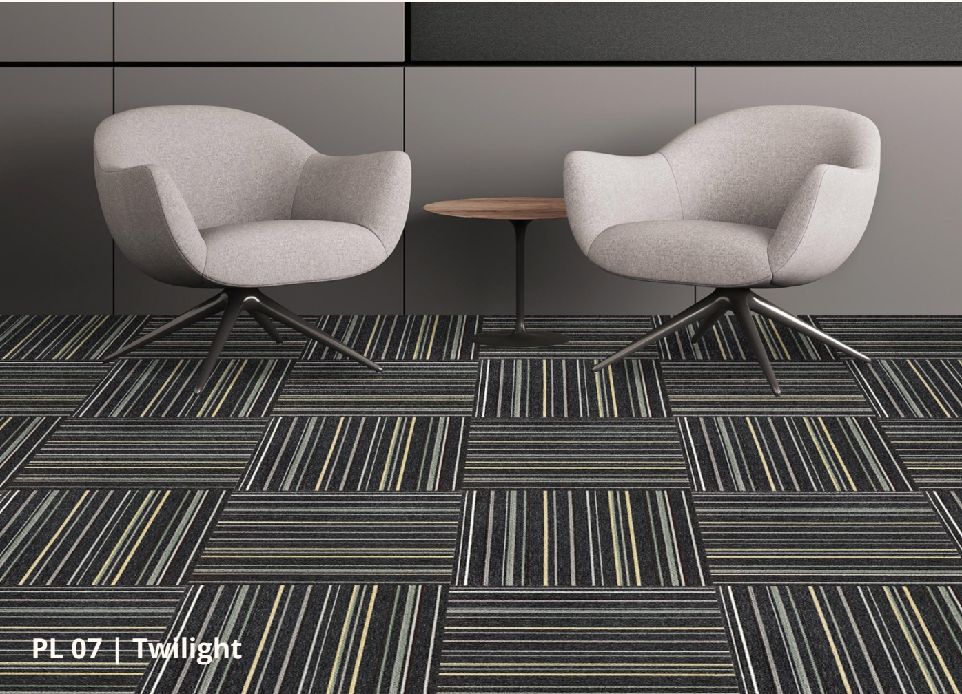
PL 07 | Twilight